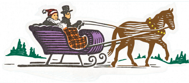
Christmas in Bedford Falls Festival December 10 th .